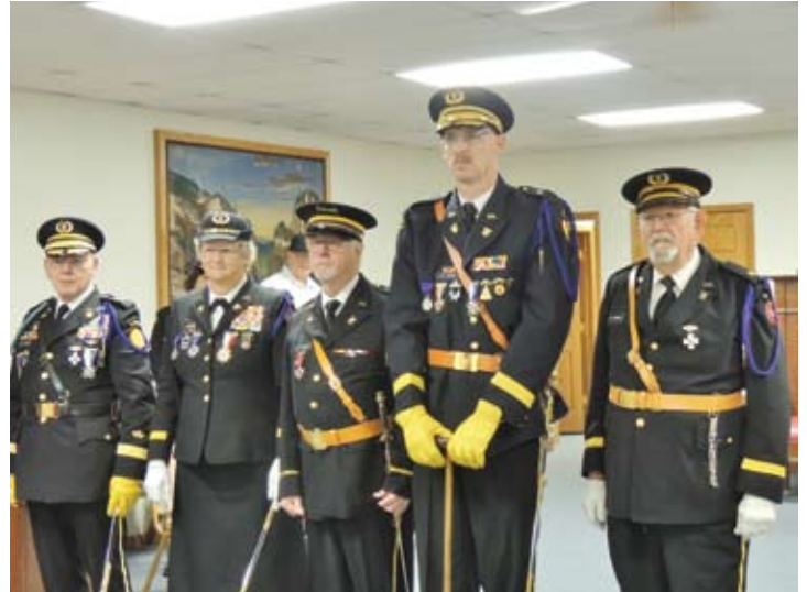
Pictured is the Department Council Officers for 2018: left to right.