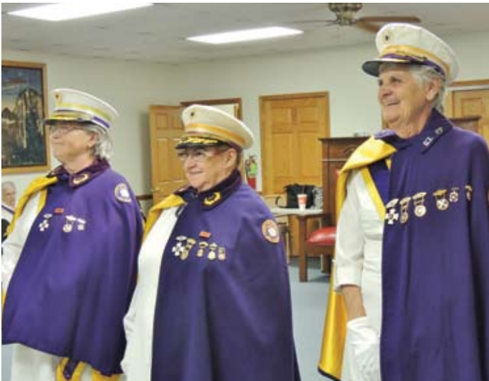
Pictured are the Department Association Officers for 2018: left to right.