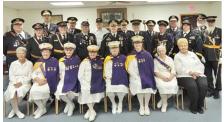
Pictured are the attendees at the Illinois Department Council and Department Association meeting held October 22, 2018 in Lincoln.