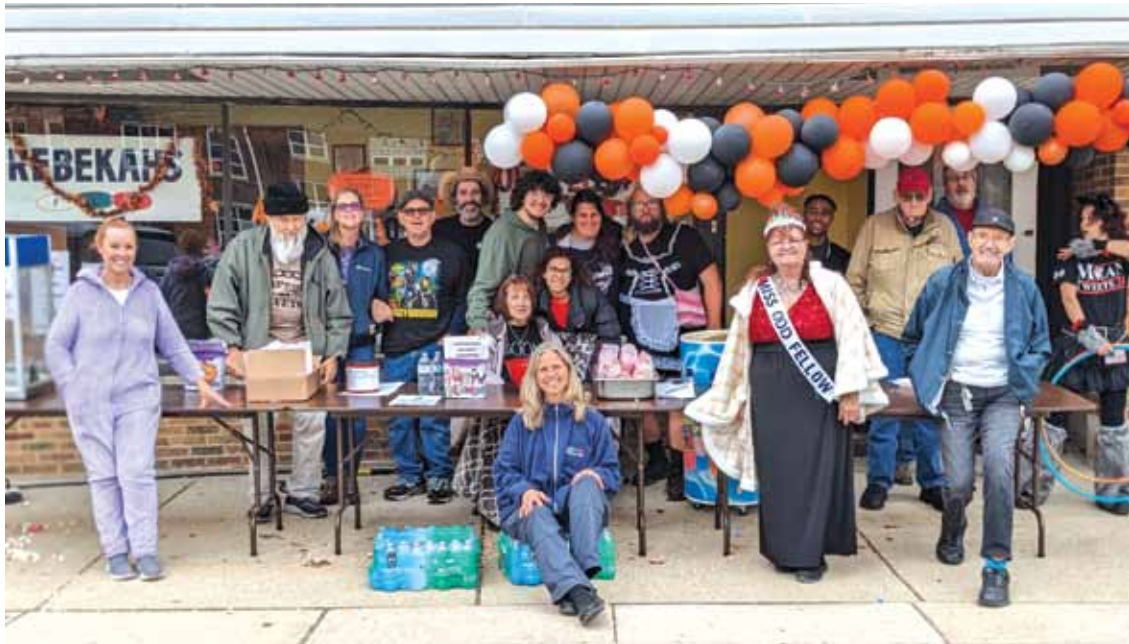
Palacky Lodge #630 participates each year in the town trick or treating event giving out popcorn to the residents. This year we gave out nearly 1500 bags of popcorn!